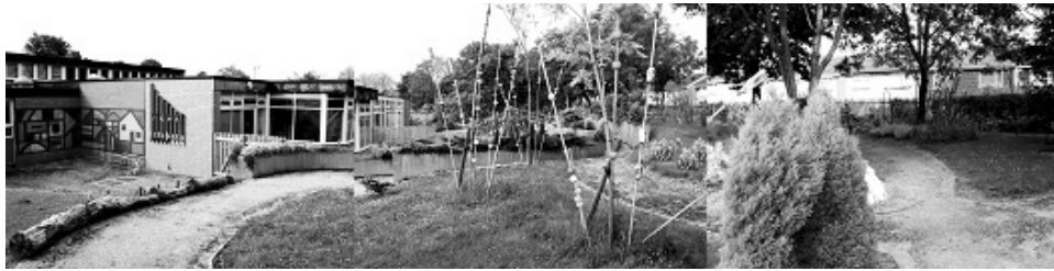
Image 14: Green Space (zone C). It consists of a covered tunnel, seating, a sloping lawn, musical pipes, a textured wall as well as raised beds with herbs and scented plants. Environmental art and willow weaving add richness of the area. The zone covers 337 sq. metres.