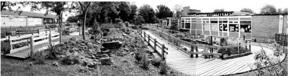
Image 13: Water Garden (zone B). It includes a pond with marginal plants, an interactive fountain with talking tubes and slate stone channels. It acts as a visual and focal area in the sensory garden. Low wooden handrails were used and kept to a minimum so that users can have close contact with the water feature using boardwalks and bridges. It also comprises rough, loose stones that can be moved around to divert the direction of the water channels. This allows close engagement with the environment. The zone covers 223 sq. metres.

suggests that the value of a place is not determined by its appearance or aesthetic qualities but by its physical properties and the different activities that they offered (Gibson, 1979; Whitehouse et al., 2001).