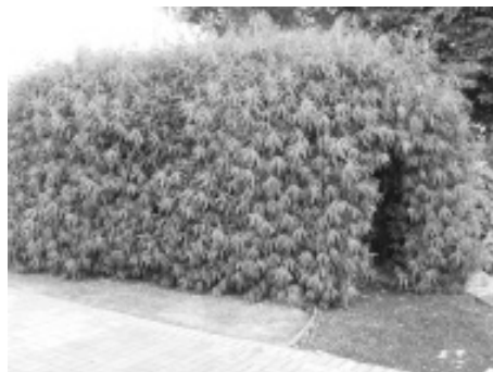
Image 8: Green Space One (zone C). Includes a willow tunnel with a bark chip surface, a lawn, seating, scented plants, lighting bollards and a vaporised trail 7 . This zone covers 316 sq. metres.

The students moved over to the willow tunnel. 'Where are we, Hamzah?' the teacher asked. They went through the tunnel slowly to give the students time to respond to the experience of slight coolness from the shadows. 'Willow, willow all around...willow, willow all around...,' chanted the teachers, while wheeling their students through the willow tunnel. Then they stopped in the middle of the tunnel and played with the artwork display. They touched and felt the artwork. Some hit and heard the sound of rattling decorative cans.