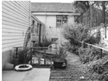
Image 5: An example of what a sensory garden can look like if it is not well maintained.

3. In the interview that the researcher conducted with Stoneham (2006), she stated that to date, there had been no rigorous research done on the topic of sensory gardens. She added that a considerable amount of research needed to be conducted in the area of sensory impairment, mainly with regard to discovering what people with special needs really need. She warned that a great