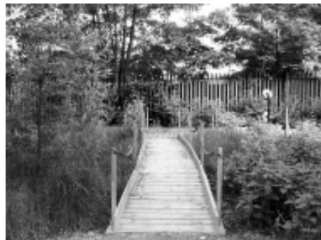
Image 15: Woodland Garden (zone D). Also known as the sound garden or the sound trail. It integrates an artwork display, a boardwalk with rope railing and a variety of sound stimuli. Lush and rich woodland planting provide texture, sound and scent as well as inviting wildlife. A strong contrasting area of dark and shade offers experiences that are different from other areas. This zone covers 556 sq. metres.

seats to sit on. Therefore, the focus on seated activity is an equal concern with moving because students with special needs sit in different features than the staff.