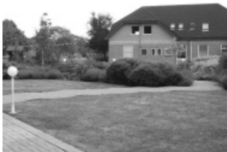
Image 7: Exploraway (zone B). This zone offers more difficult challenges in terms of the change in levels, together with the larger surface textures of loose stone. The zone covers 511 sq. metres.

The group of students and teachers undertaking the literacy session did not use this zone because its surface was unsuitable for wheelchair users. However, in a preliminary interview the researcher conducted with Anne Gough (July 21 st , 2006), who is a teacher of children with multi-sensory impairments up to age 16, she used the trail with 'Jo', who has poor sight. 'Jo' found her way around the sensory garden very well, using the scent of lavender and, when she smelt it, it reminded her of her mother at home, who had also had it planted in her garden. According to Kaplan (1976),