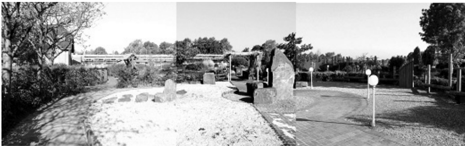
Image 10: Asteroid Arts Garden (zone E). Open space with gravel and wood edge, boardwalk, musical instruments, balancing beam, rock sculpture, lighting bollards, shrubs and pathways. This zone covers 231 sq. metres.

'Underneath the pergola, underneath the pergola...', the teachers sang. Everyone grouped around the fountain to hear the water. They chanted in a whisper, 'Can you hear the water trickling? Can you hear the water trickling?' Some students jumped in their wheelchair while making loud, shrill noises, showing their excitement! The teachers helped the students to feel the water from the