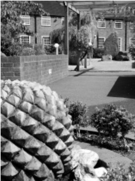
Image 11: Water Central Area (zone F). This zone has a focal area with water feature that offers a contrasting texture between the soft water and the rough 'pineapple' surface. There is a pergola with climbers linked to the central space garden as well as raised planters with seating and easy access to herbs and scented plants. This zone covers 230 sq. metres.

LS is a non-residential special school. The school hours are from 9am until 3pm, Mondays to Fridays and it caters for children with complex needs, and profound and multiple disabilities from the ages of two to eleven years. The inspiration for having a sensory garden (see Plan 2) came from the school's Deputy Head, Dave Jones, who died in summer 2002. In January 2003, the