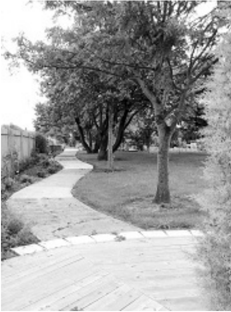
Image 12: Rainbow Walk (zone A). The Rainbow Walk surface offers different colours and textures, which provide a broad learning experience. It includes a kickabout area with lawn and trees that provide shade. The zone covers 767 sq. metres.