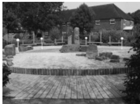
Image 3: An inaccessible path to significant features in a sensory garden.

ii) Loose materials on the surface of paths, such as gravel separated by wood edging, are inaccessible to wheelchair users, therefore, such users are unable to appreciate significant features that can only be assessed in this way 4 (see Image 3).