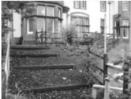
Image 4: Steps like this are common in a sensory garden. As a result, wheelchair users are not able to access some parts of the garden.

iii) Ramps, even with an accessible gradient, were not appreciated by the staff of the schools, as they were concerned about the slippery surface. Steps were also not favoured; especially by wheelchair users and their carers (see Image 4)