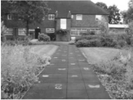
Image 9: Green Space Two (zone D). Includes a lawn patches, trees, hedges, lighting bollards, pathways and a rubber walk. This zone covers 370 sq. metres.

(Picture Exchange Communication System), which involves showing photographs and finding objects in the sensory garden using touch, hearing, smell and sight. This exercise is beneficial for way finding and identifying significant features in the sensory garden.