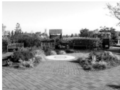
Image 6: Parents' Waiting Area (zone A). Sited at the entrance to the sensory maze and it utilises an underused fringe area with seating and a textured wall. It is easily accessible from the car park and main building entrance. The zone covers 660sq. metres.

Zone A: Parents' Waiting Area (see Image 6)