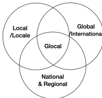
Figure 3. An Interpretation of Brock’s Model of Analytical Scales for Education

A third contribution is Brock’s emphasis on the importance of scale. Scale in geography refers to an actual or imagined framing of the space. He regarded the national scale as the normal regulated space produced through national educational policy, however, the national total or average view in education statistics is often misled by the complexity of education provision. Therefore, he argued that the local-global dynamics in education should be understood with reference to, instead of absence from, national and regional scales that connect and contrast the local and the global. Figure 3 is made to illustrate his view of connected scales from local to global.